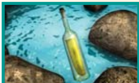
Meaningful messages or foolish flotsam? Floating bottles lead Nancy Drew on a kayak cruise through a dangerous sea cave maze.

A much-anticipated vacation to a remote island in the Pacific Northwest abruptly runs aground when you, as Nancy Drew, discover that a whale-watching boat has been vandalized. But that's just the first in a string of nasty "accidents" in Snake Horse Harbor. Is the trouble related to the orphaned orca whale roaming the nearby channel, or is there a deeper threat shrouded in the approaching fog?