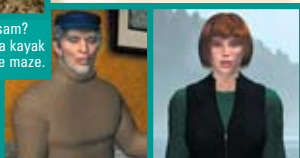
Roving sea monsters, hidden valuables, midnight smugglers and shanghaied pioneers: Nancy must glean facts from fish tales.