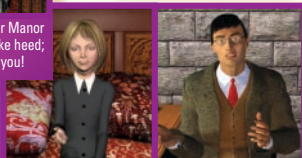
Manor inhabitants hold important keys to hidden spaces. It's up to you to unlock the truths secreted inside.