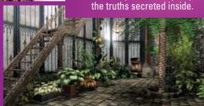
Old Mrs. Drake spends most her time feeding the conservatory's carnivorous plants. Careful; get too close and you might be a hungry plant's next meal!

Don't miss any of the Nancy Drew Interactive Mystery titles from Her Interactive: The Secret of Shadow Ranch Based on the Best-Selling Nancy Drew Book of All Time! Danger on Deception Island Museum of Science, Boston 2003 Top Choice Software Award The Haunted Carousel Winner of Parents' Choice Gold Award Ghost Dogs of Moon Lake Winner of Parents' Choice Gold Award Secret of the Scarlet Hand Winner of Parents' Choice Gold Award The Final Scene Winner of Parents' Choice Gold Award Treasure in the Royal Tower Winner of Parents' Choice Gold Award Message in a Haunted Mansion Winner of Parents' Choice Gold Award Stay Tuned for Danger National Parenting Center Seal of Approval, 2000 Best Software Secrets Can Kill Winner of Good Housekeeping Top Ten CD-ROM, and many other awards